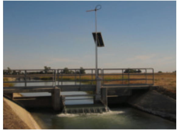
NeuroFlo software controls the actions of the FlumeGates and the flow rate of the pumps to maintain stable water levels.

“With Rubicon’s Network Control Solution we pump only the water we need. We’re able to keep more water in the river and save pumping costs. When we made the decision to go with Rubicon hardware and software products, we were sure they could handle our unique situation. We haven’t been disappointed.