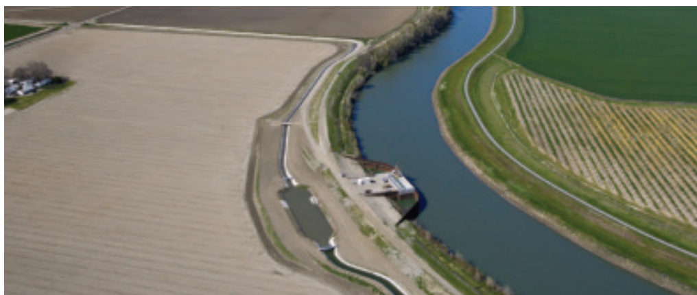
An aerial view showing the new pumping plant drawing water from the Sacramento River into the afterbay, which feeds the North and South channels.