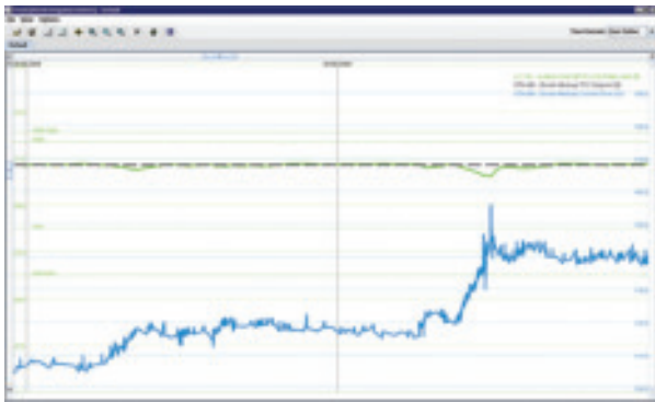
The SCADAConnect graph illustrates a FlumeGate along the South Channel automatically adjusting its flow rate (blue line) to maintain the channel water level (green line)