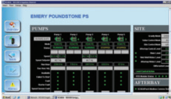
SCADAConnect allows operators to remotely monitor the pump station and control FlumeGates at the six offtakes